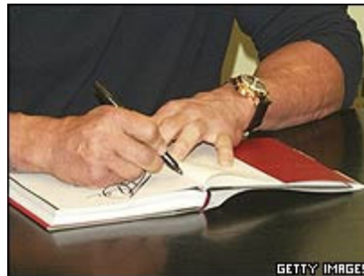
A book-signing can do more to shift stock

"We don't do a national promotion, even though