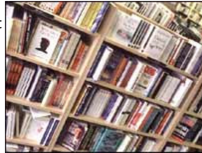
Shops rarely order more books just because of a festival

"People can find out about authors they didn't know about, whether they are famous authors or new writers."